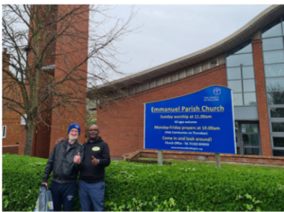
Emmanuel Church, Bridlington