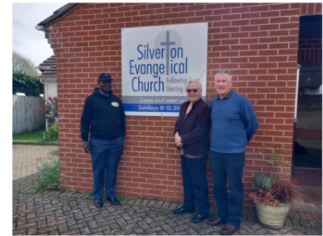
Silverton Church, Exeter

Can you help TABS? We are looking for a treasurer to join our team - are you a numbers person or just have a few hours spare a month? Contact one of the TABS Trustees for more information or email info@tabsinternational.org